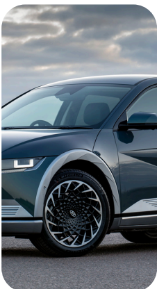
Hyundai Ioniq 5