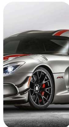
Dodge Viper ACR