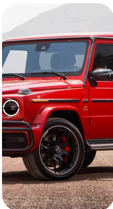
Mercedes G Class